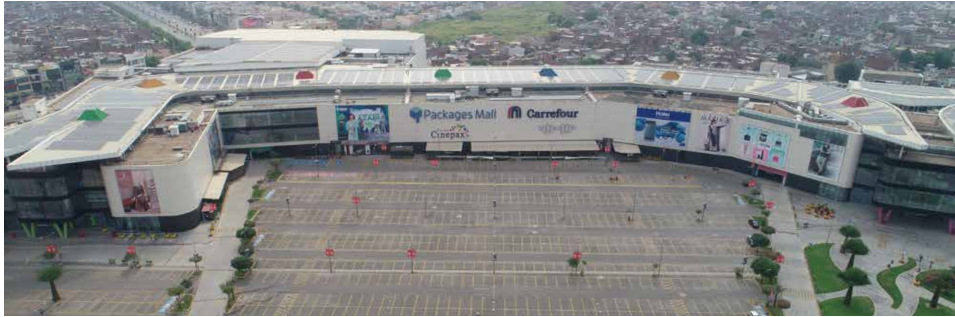
Packages Mall, Lahore