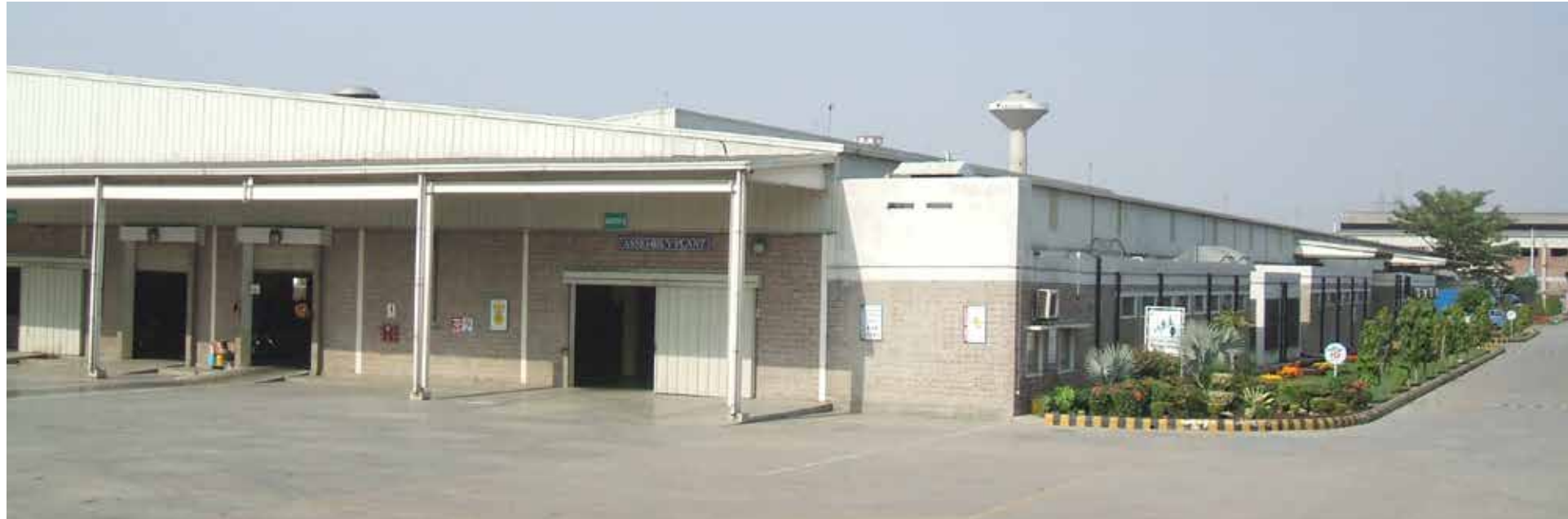
Honda Motorcycles, Sheikhpura