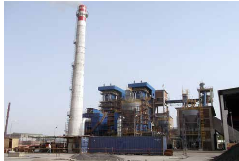
15 KW Power Plant, ICI, Sheikhpura