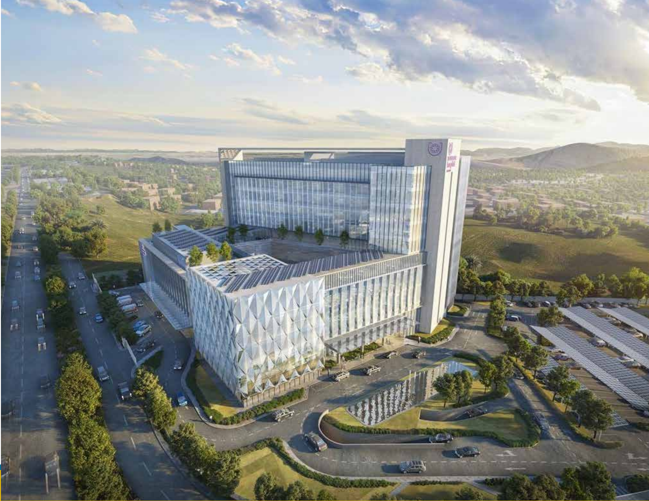
Novacare Hospital, Islamabad