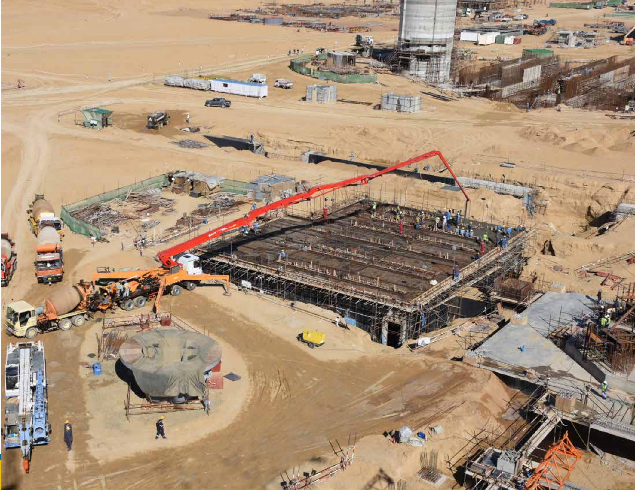
Metro Cash & Carry, Islamabad