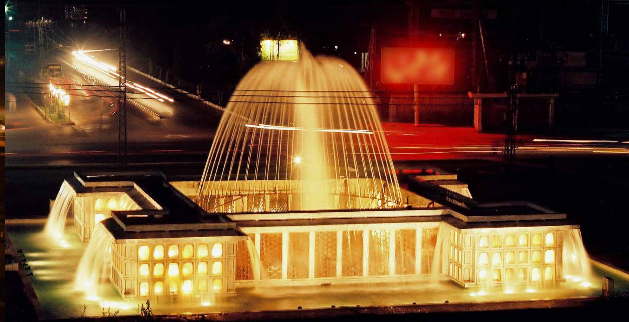
Liberty Roundabout, Lahore.