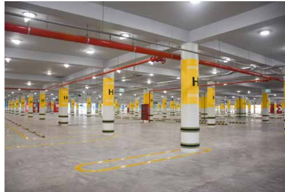
Allama Iqbal International Airport, Parking expansion, Lahore