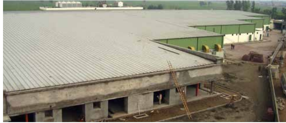
Nishat Dyeing, Lahore