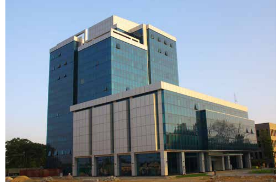
Attock Oil Head Office, Rawalpindi