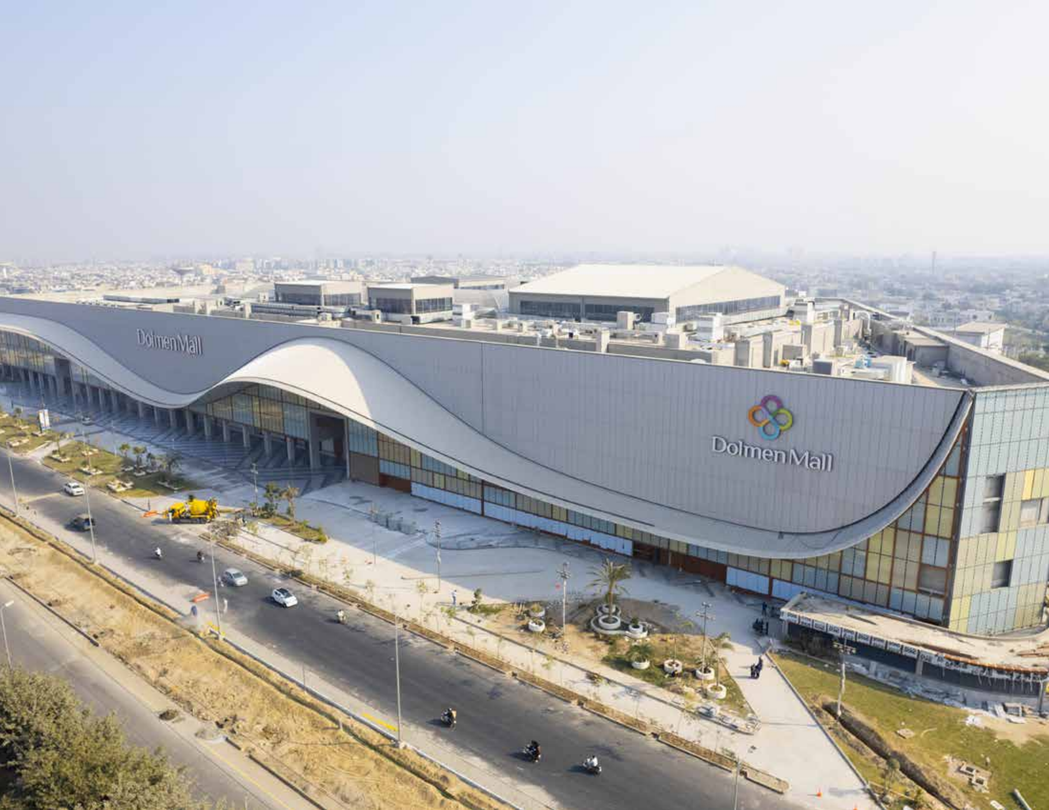
Dolmen Mall, Lahore