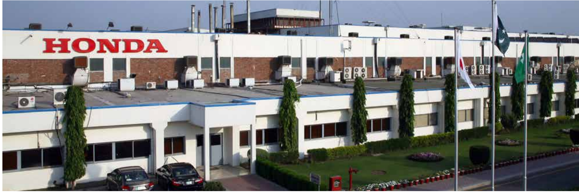
Honda Cars, Lahore