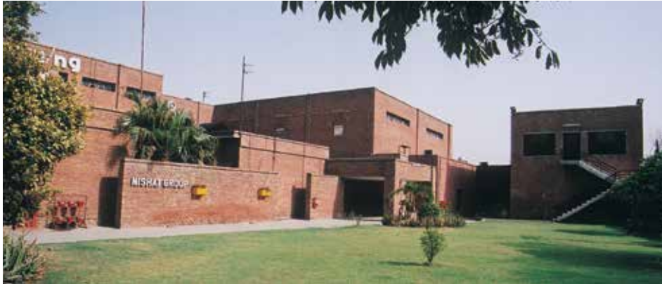
Nishat Sewing Unit, Lahore