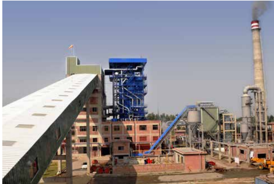
9 MW Power Plant, Nishat Dyeing & Finishing, Lahore