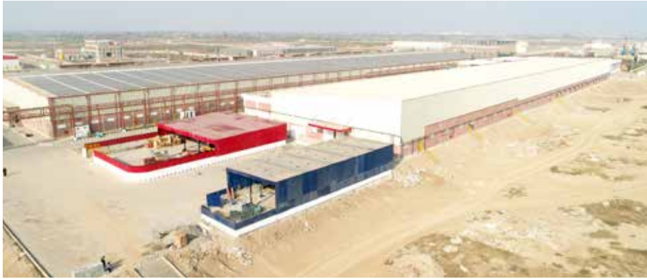
Nishat Textile, Faisalabad