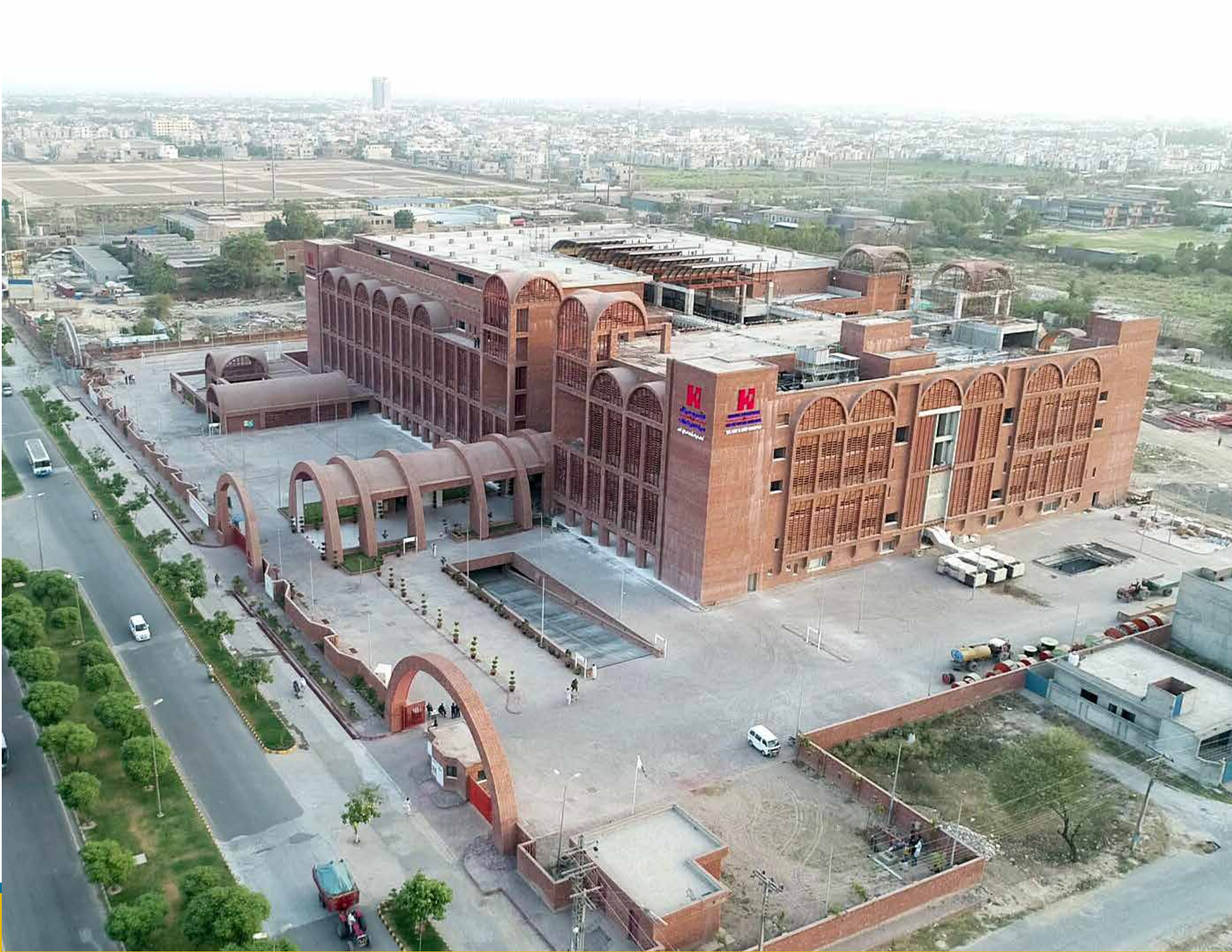
Hameed Latif Hospital, Lahore