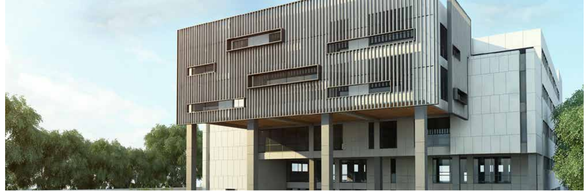
Coke Head Office, Lahore