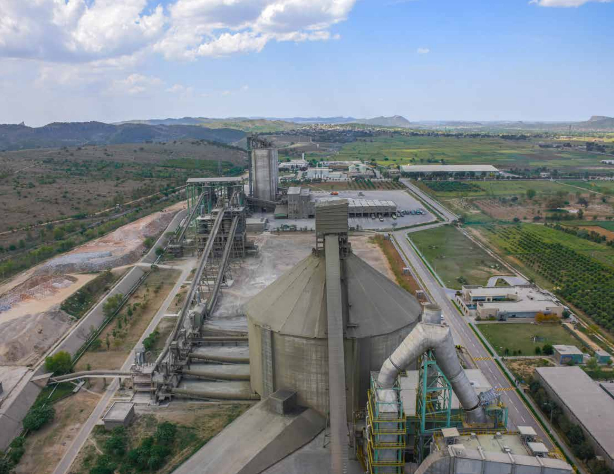
D.G. Cement Plant, Kallar Kahar