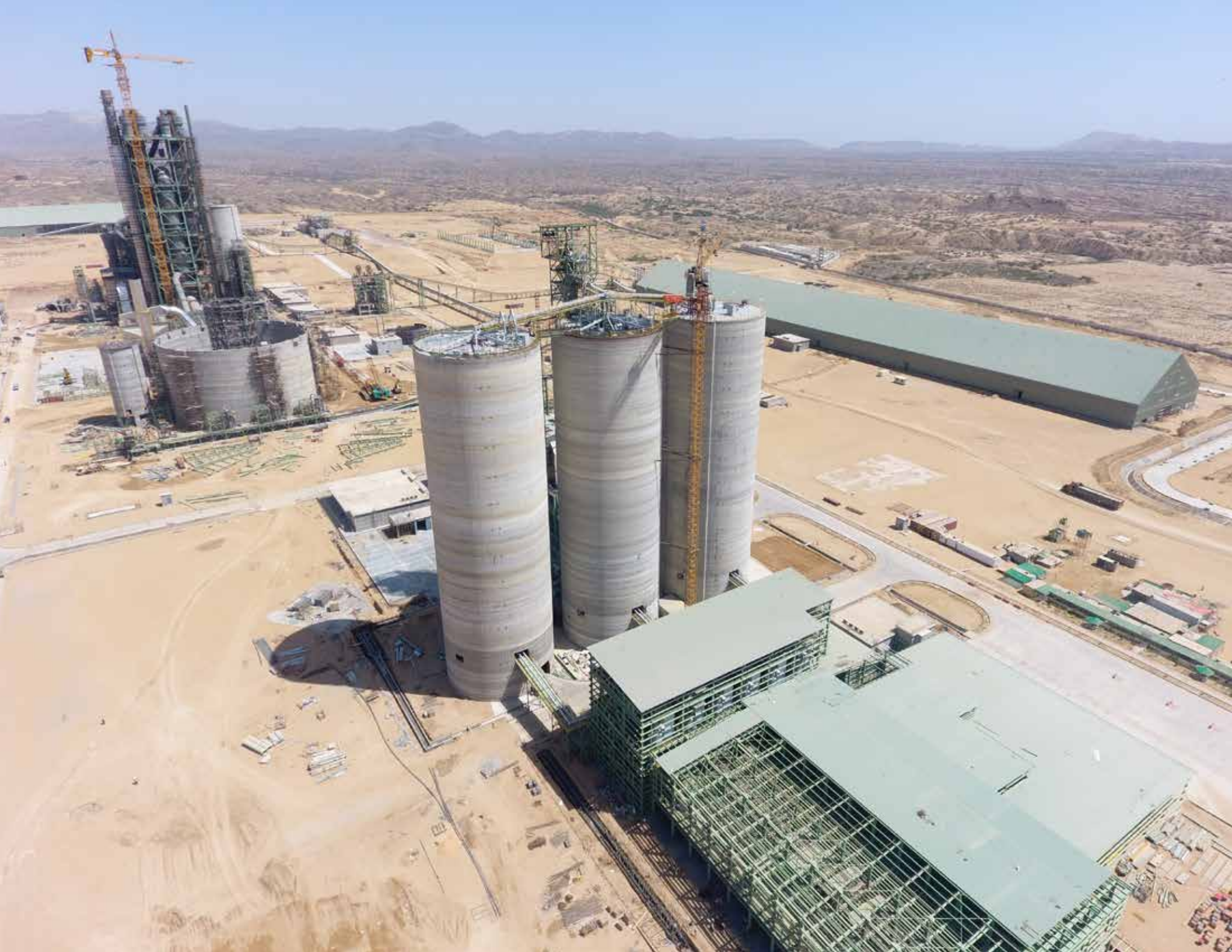
D.G. Cement Plant, HUB