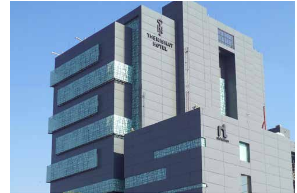
The Nishat Hotel, Lahore