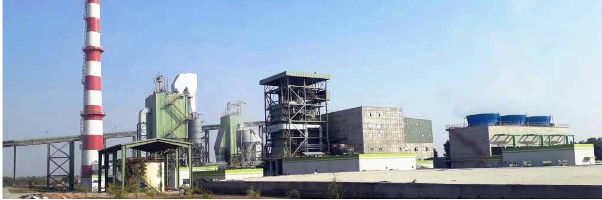
30 MW Power Plant, D.G Cement, DG Khan