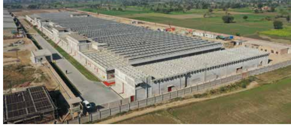
Riaz Textile, Sheikhupura