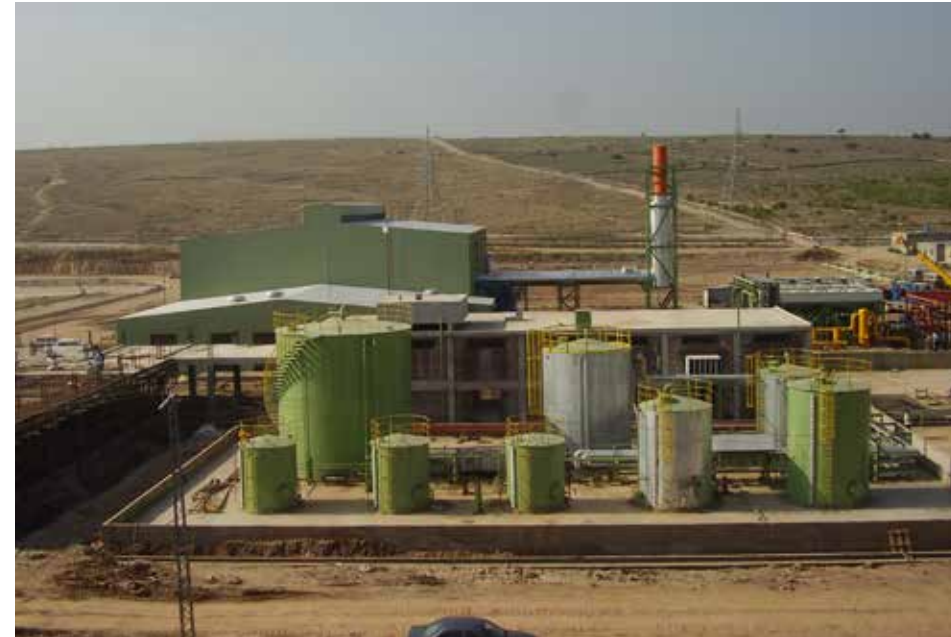
3 x 16.4 MW Power Plant, D.G Cement, Kallar Kahar