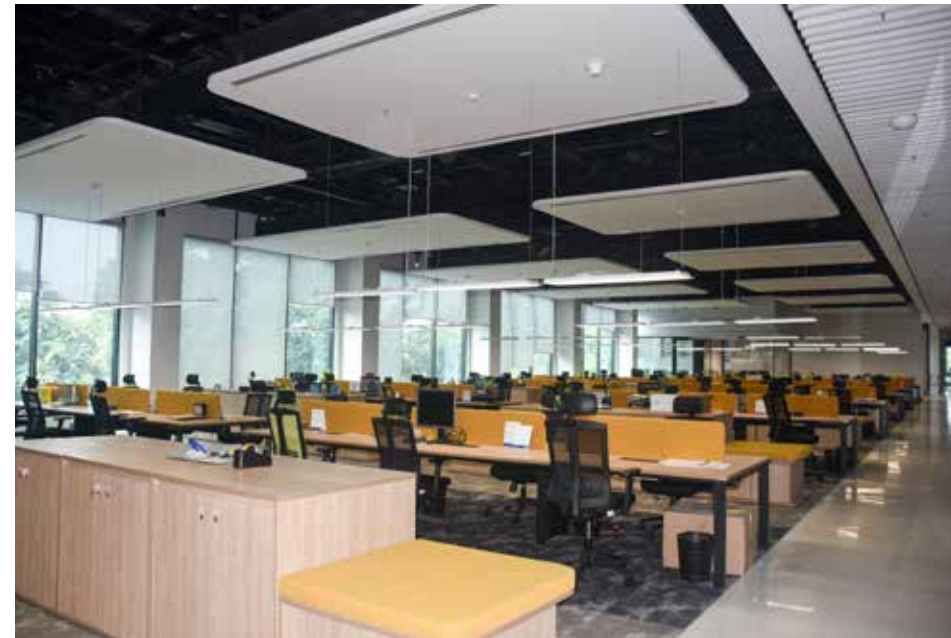
Nestle Head Office, Lahore