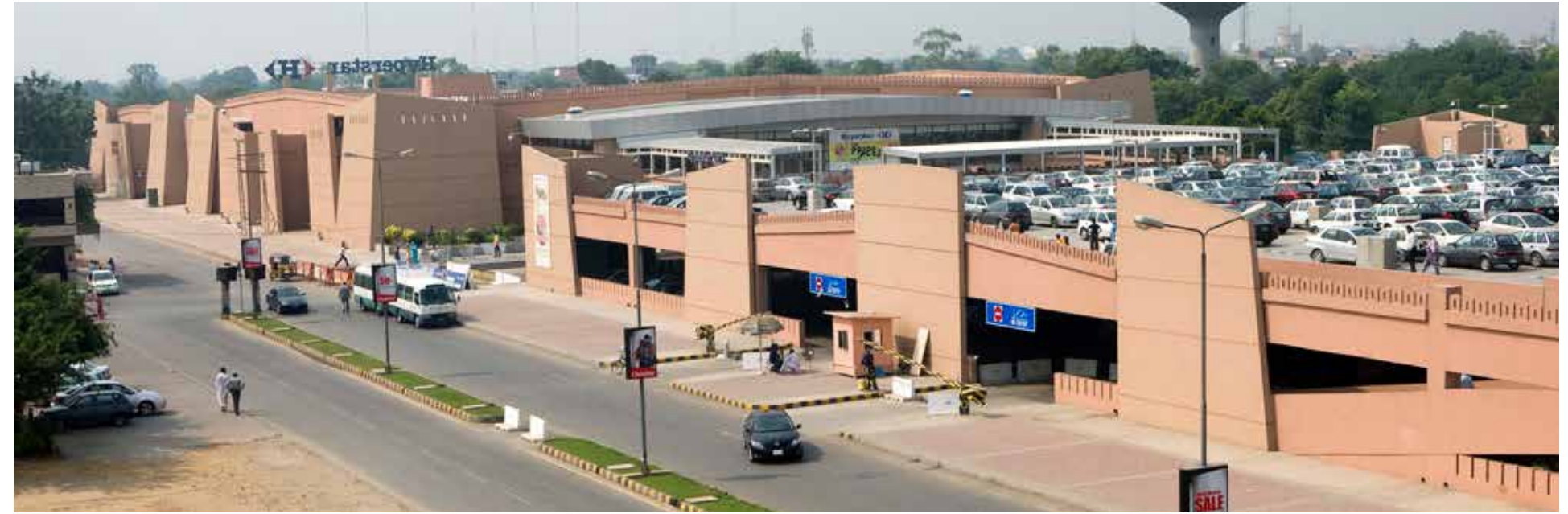
Hyperstar, Fortress Stadium, Lahore