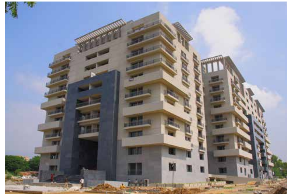
Silver Oaks, Islamabad