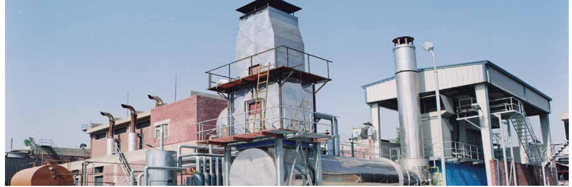
Nishat Power Plant, Feroze Wattwan