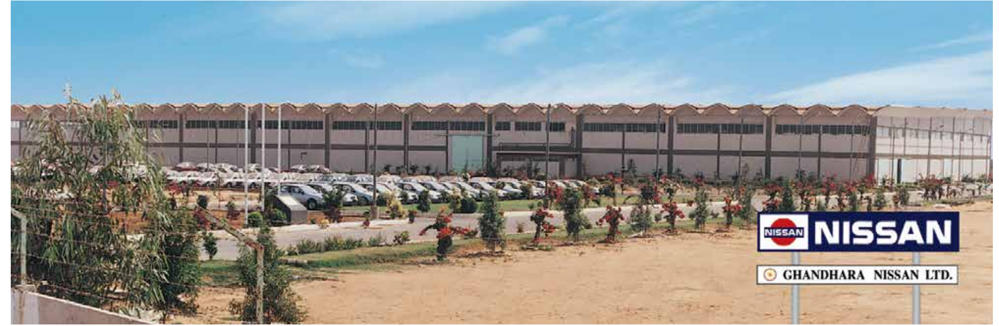
Nissan Gandhara, Karachi