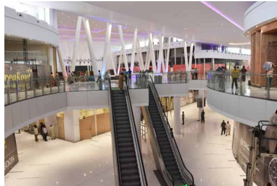
Packages Mall, Lahore