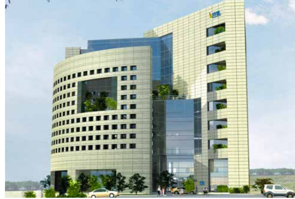
Fauji Fertilizer Head Office, Islamabad